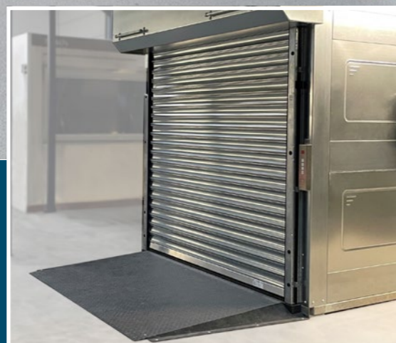
ESCORTA® with automatic roll shutter doors